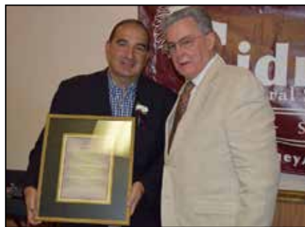
William C. Mirabito '78 Excellence in Business and Community Service