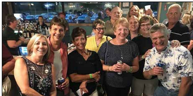
The Class of '73 arrived ready to celebrate their 45th Reunion on Friday night at the Elks where the band SPLASH rocked the dance floor 'til midnight.